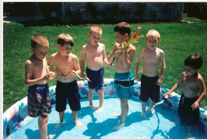
chilling out at the pool